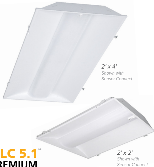
2' x 4' Shown with Sensor Connect