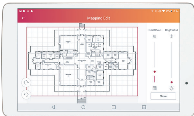
Floorplan image registration