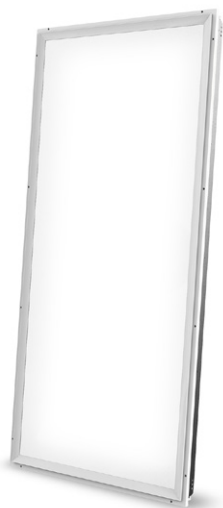
2' x 4' Flat Panel LED