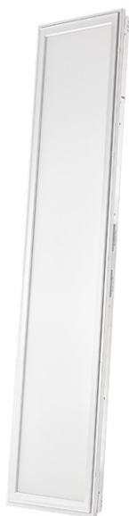
1' x 4' Flat Panel LED