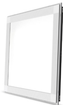
2' x 2' Flat Panel LED